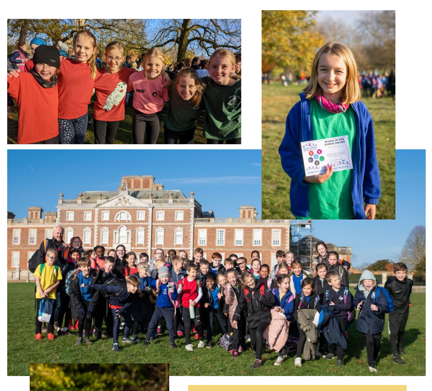
The Wimpole Cross Country event!