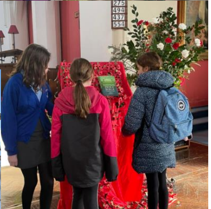
Year 5 and 6 had a fabulous day exploring different places of worship in Bedford. We are so lucky to be offer these kind of experiences to our children at Pendragon.